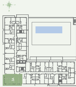
Map/Plan of Floor 5 & 7.